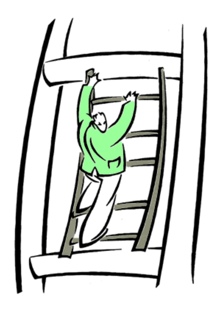
A Self Help Guide